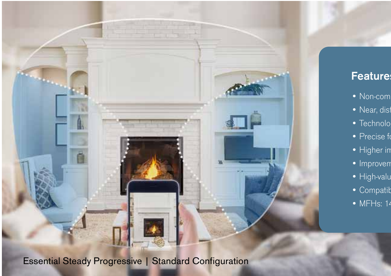
Essential Steady Progressive | Standard Configuration

Those in need of a high value, reliable solution. Part time eyeglass wearers and wearers with lower prescription and addition powers.